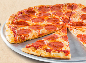
*Charged as Double toppings

ONE SIZE ONLY 9" (SMALL) 7.25 EA Your choice of toppings in a 9" serving pan WITHOUT CRUST, featuring our premium toppings with a base of our special pizza sauce and topped with our unique blend of cheeses and shaker mix. Low in carbs and rich in flavor. CALORIE INFORMATION CAN BE DERIVED BY DEDUCTING THE CALORIES ATTRIBUTED TO THE CRUST, WHICH IS AVAILABLE UPON REQUEST.