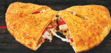
SERVED WITH SIDE OF MARINARA SAUCE