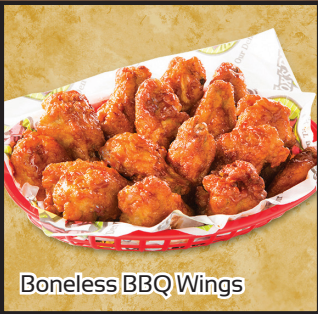
Boneless BBQ Wings

Traditional or Boneless 1/2 Pound 5.49 Pound 9.99 Served with your choice of homemade sauces Side of Ranch .50