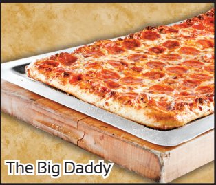
The Big Daddy