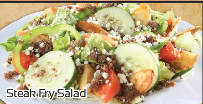
Steak Fry Salad