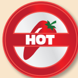
(6) 280 Cal (12) 550 Cal