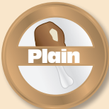
(6) 210 Cal (12) 420 Cal

Breaded, seasoned style wings smothered in your favorite flavor.