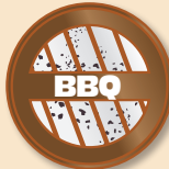
(6) 340 Cal (12) 680 Cal