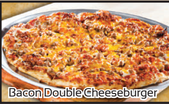
Bacon Double Cheeseburger