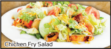
Chicken Fry Salad

A tossed salad with fries, marinated steak, and pizza cheese. Served with your choice of dressing. 6.99 - 720 Cal/Order