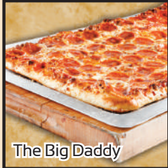
The Big Daddy