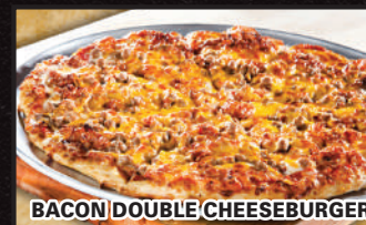
BACON DOUBLE CHEESEBURGER

Our original white sauce with 3 cheeses and tomato. 240-280 Cal/Slice Sm 5.99 Md 9.25 Lg 10.99 XL 13.25 BD 17.99