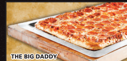
THE BIG DADDY

GET AS MANY TOPPINGS AS YOU LIKE - YOU ONLY PAY FOR SIX! NOT valid with Big One Pizza DOUBLE TOPPINGS ARE EXTRA.